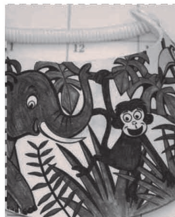
Colorful sunshade from 2011 Jungle

Email rbeyerlein@ameritech.net with questions or call 586-718- 5076